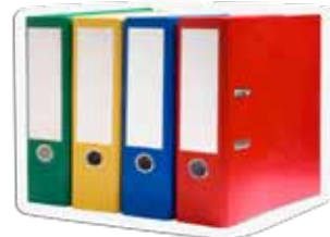
Paper-based Learning Materials