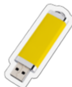
USB Flash Drives

The Australian Government is helping with the cost of educating your kids.