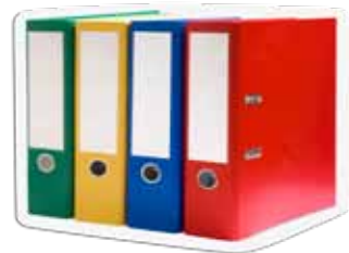
Paper-based Learning Materials